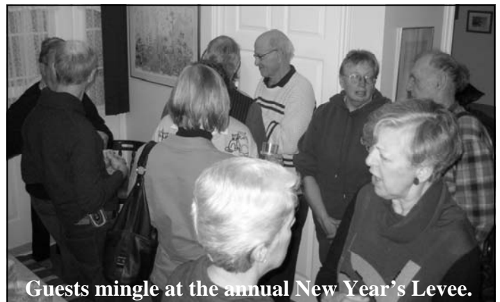
Guests mingle at the annual New Year's Levee.

Many thanks to the South Marysburgh Recreation Committee who sponsor this occasion and so many others throughout the year.